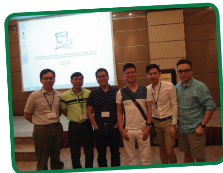
The 14th IEEE International Conference on Advanced Learning Technology (ICALT 2014) at Athens, Greece